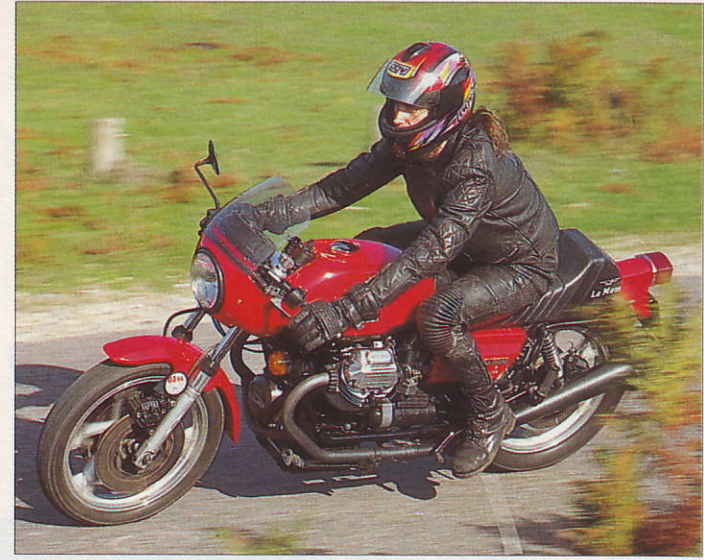
Riding the Le Mans well demands strength and commitment.

If the choke levers are worn and in the habit of snapping back to the off position, then starting a Le Mans from cold can best be described as a wrist-breaking experience. This one was still warm from the run out and caught easily.