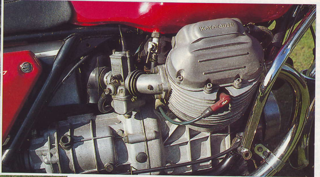
The smaller VT motor (left) will out accelerate its 850 stalemate above.

far quicker than any of my later Guzzis and, having a smaller engine, there isn't so much torque reaction from the shaft.