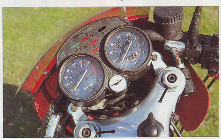
The Le Mans has a 'take-no-prisoners' riding position.