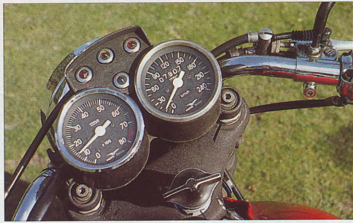
The V7's swan-necked bars are multi adjustable.

Twisting the throttle hard changed the pleasant duff-duff to a hard edged roar and the bike took off with a willingness that sur-